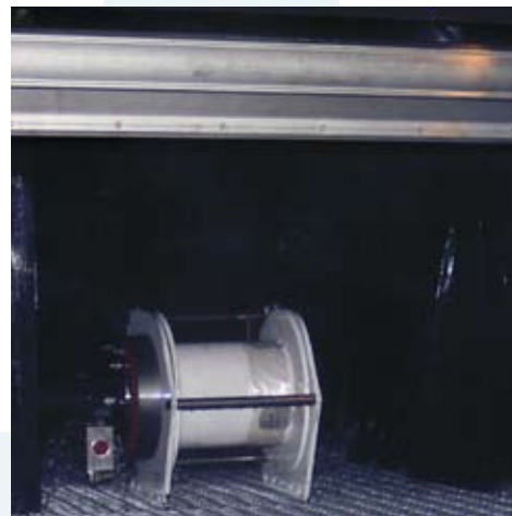
Blow off for parts drying