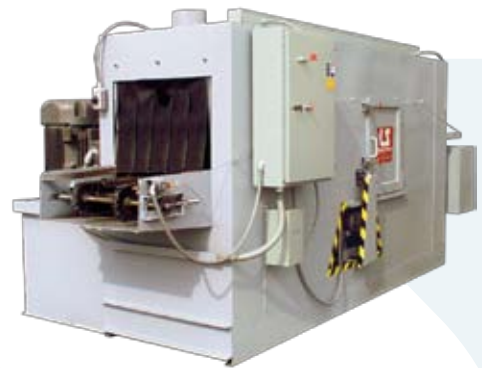
8' Flow Through Washer 8FTW