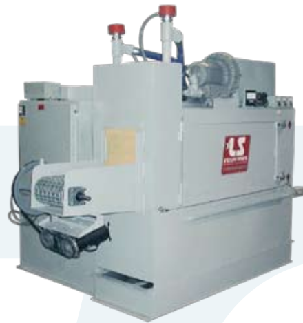
Cell washers for manufacturing integration