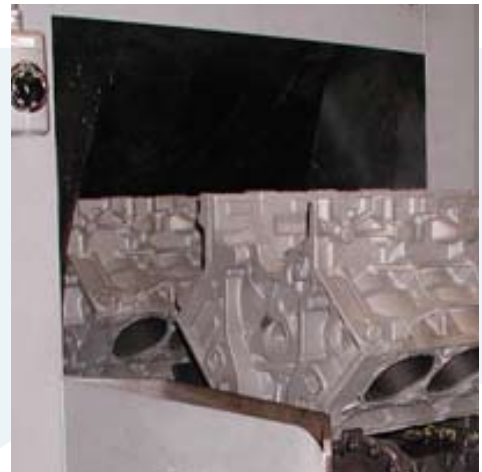
Engine blocks after washing

LS Industries' washers are backed by a full One Year Warranty. Our Parts Department offers a complete line of detergent and replacement parts available with just one phone call.