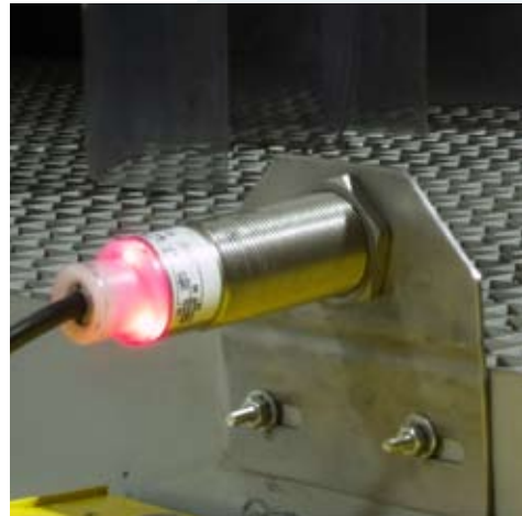
Work sensing eye for system automation